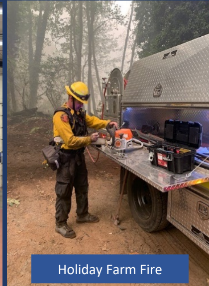
Holiday Farm Fire

With a successful $0.35 cent levy, we will be able to maintain our current staffing levels as well as hire three additional personnel, which will add an additional firefighter 24 hours a day, 7 days a week. This eliminates those times when only one person is staffed in portions of the district.