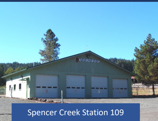
Spencer Creek Station 109