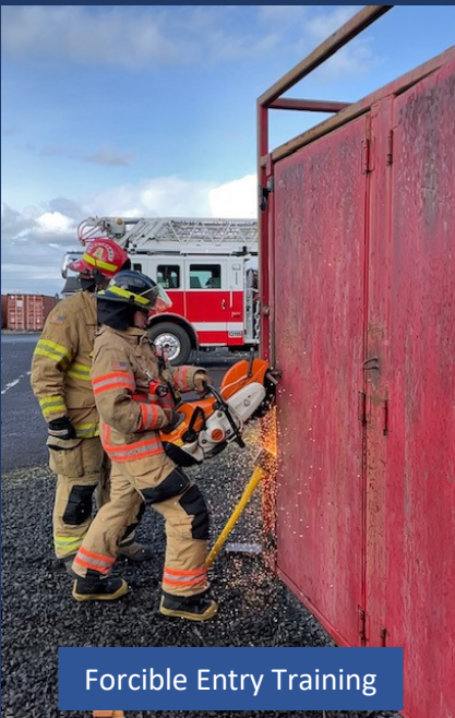
Forcible Entry Training

www.lanefire.org/may-2021-levy-information