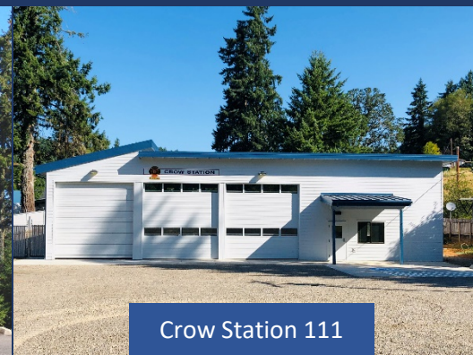
Crow Station 111