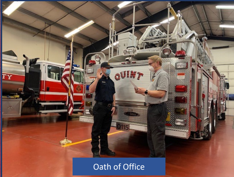
Oath of Office